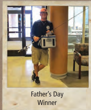
Father's Day Winner