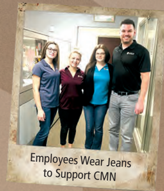
Employees Wear Jeans to Support CMN