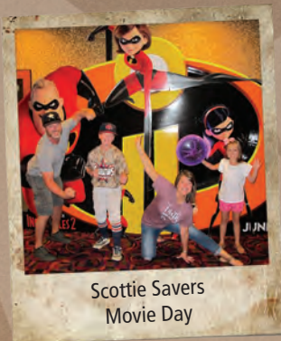
Scottie Savers Movie Day