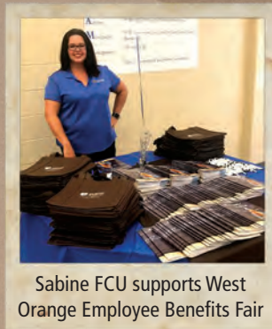
Sabine FCU supports West Orange Employee Benefits Fair