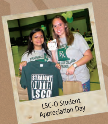
LSC-O Student Appreciation Day