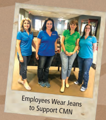
Employees Wear Jeans to Support CMN