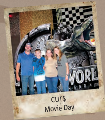
CUTS Movie Day