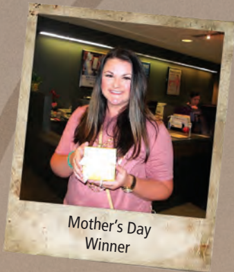
Mother's Day Winner