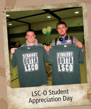
LSC-O Student Appreciation Day